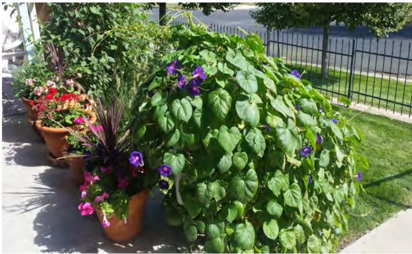
Irving Street Garden in which the residents maintain

Women seeking services can obtain a referral to Irving Street from any community service provider.