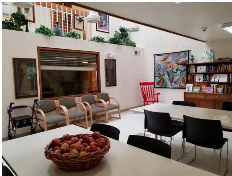
Interior photo of Irving Street's Community Room