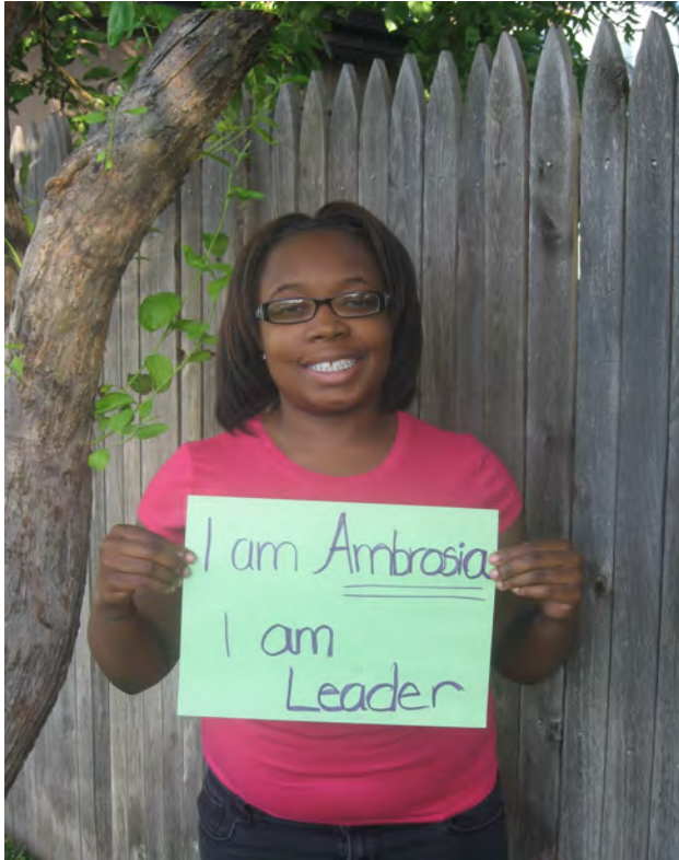
One of our participants strutting her stuff.