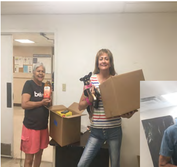
Residents Receiving Commodities Boxes at Sunset Park