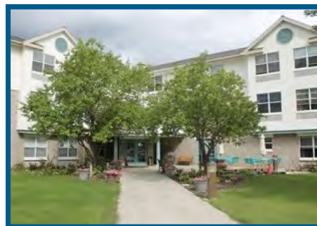
Grand View Apartments