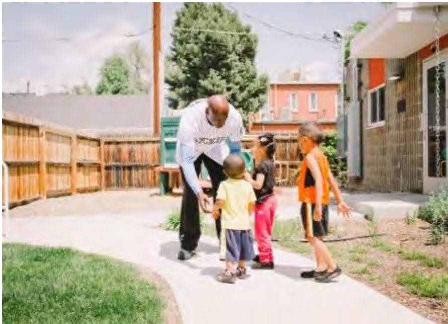
A staff person hanging out with kids during our summer celebration.