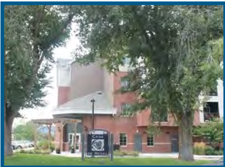
Casa de Rosal