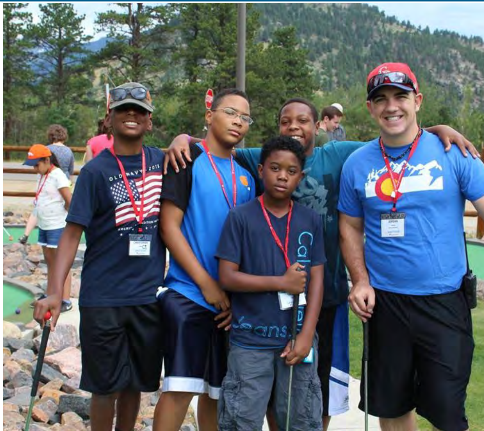
Campers enjoying a round of mini golf at YMCA of the Rockies during Camp P.O.S.T.C.A.R.D.