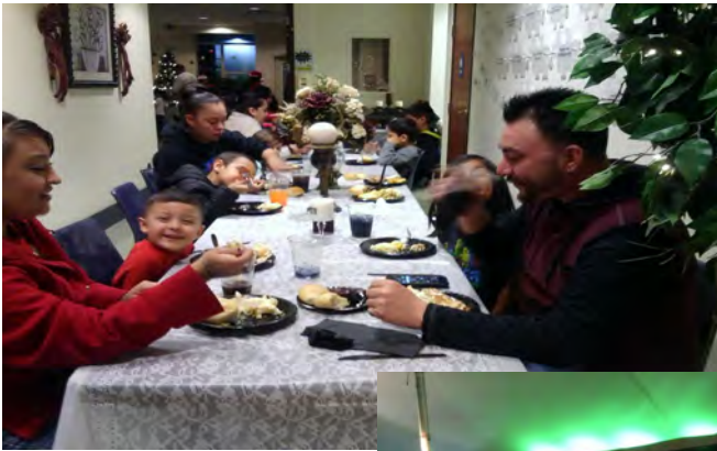
Christmas Party 2017