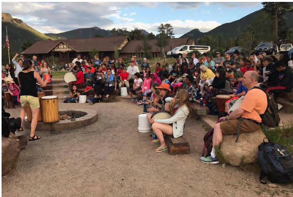
Campers enjoyed a drum exhibition before our campfire. The s'mores were delicious and for some campers this was the first time they tried them.