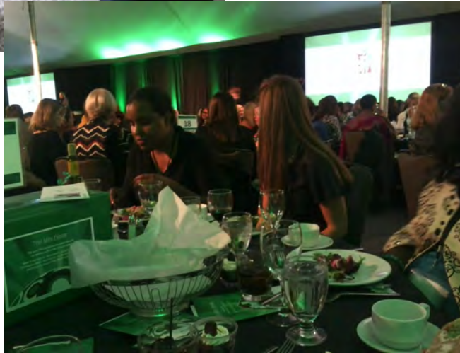
Girl Scout's Thin Mint Dinner 2016