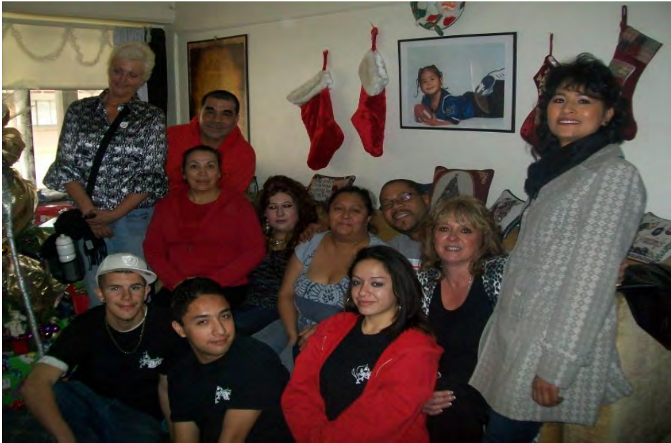
Celebrating the holidays with our families